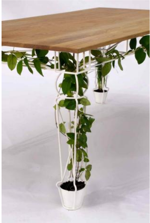
Jailmake at Maison & Objet January 2012