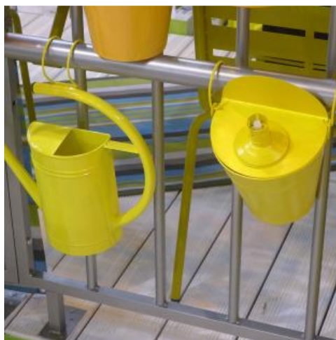
Balconia by Suntime at Glee 2011