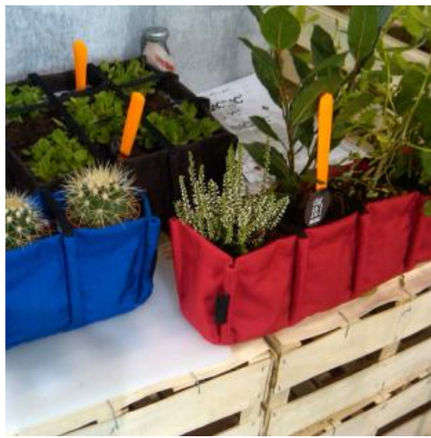
Indoor Bacsquare planters by Bacsac