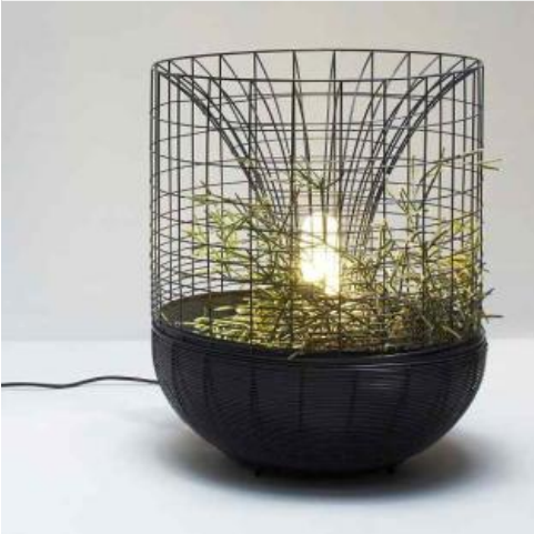
Gloriette lamp by Noé Duchaufour Lawrance for Forestier