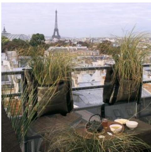
Balcony planters by Bacsac