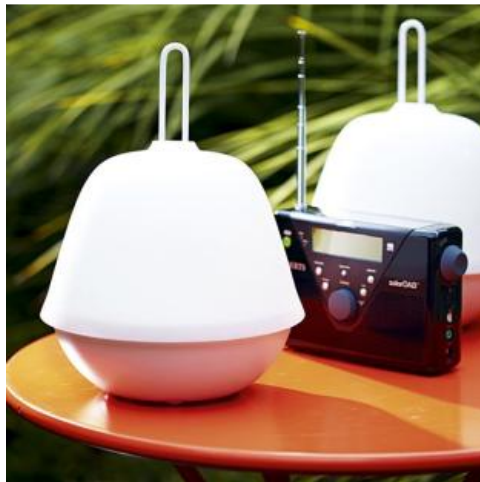
Lucile solar lanterns by Sylvain Rieu-Piquet at Ligne Roset