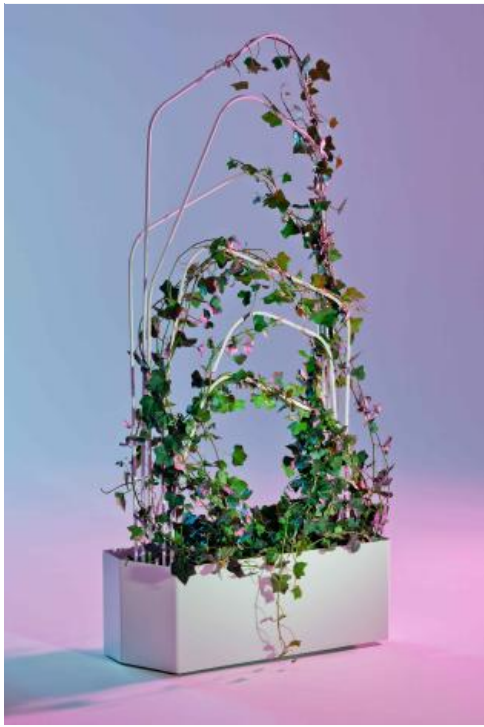
Offeect at Stockholm Furniture and Light Fair 2012