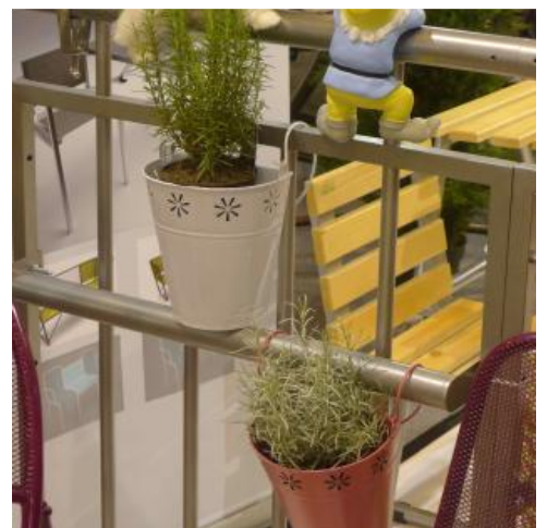
Balconia by Suntime at Glee 2011