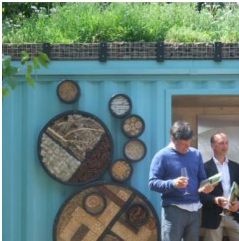
RBC New Wild Garden at The Chelsea Flower Show 2011