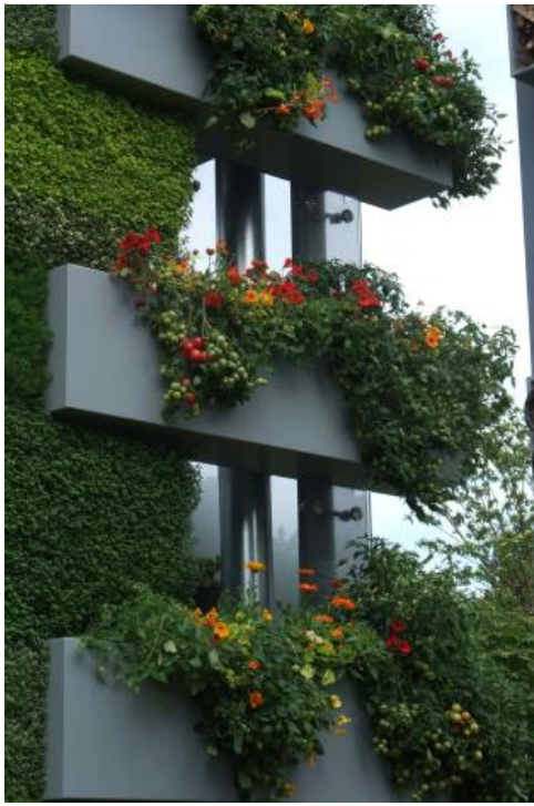
The M&G Garden at The Chelsea Flower Show 2011