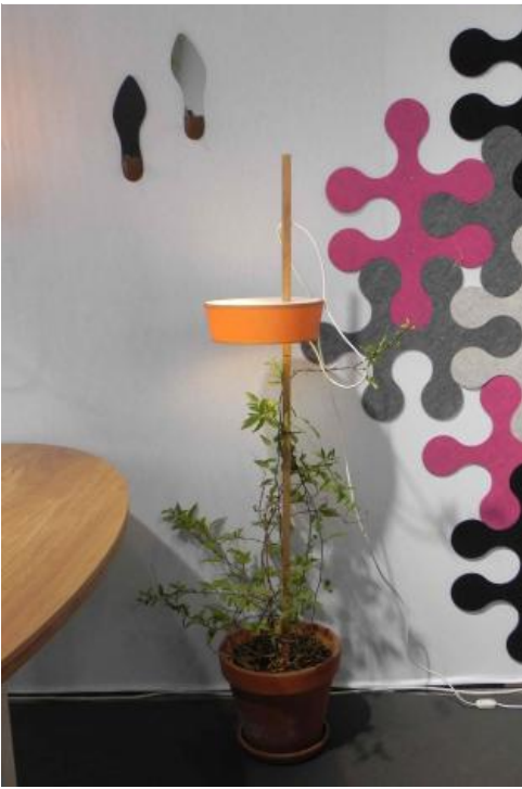
Édition Sous Étiquette at Maison & Objet January 2012