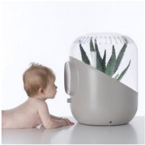
Air Purifier by Andrea