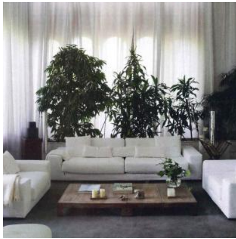
Indoor garden space