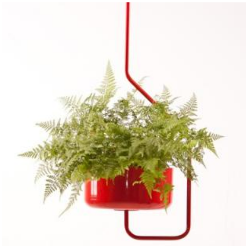
Ridge Forrester hanging planter by Joe Paine

Window boxes, balconies and porches are transformed into miniature gardens through the use of clever fixings and handles.