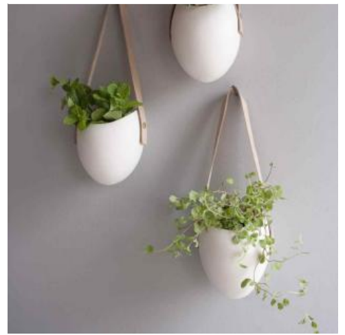
Porcelain and leather hanging planters by Farah Sit