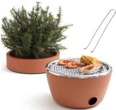
Black + Blum